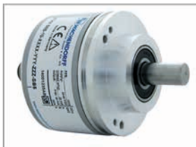
Incremental encoder WDG158B

Put together your own system for shaft copying, by selecting an encoder and specifying the length of the special belt.