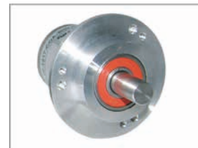
Absolute encoder WDGA58B