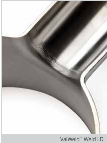
ValWeld™ Weld I.D.

State-of-the-art innovative welding technology that produces clean, consistent, and repeatable high-quality automatic welds. ValWeld™ technology breaks away from traditional orbital welding by utilizing an internal electrode, allowing us to seamlessly integrate branch connections onto full length manifolds.