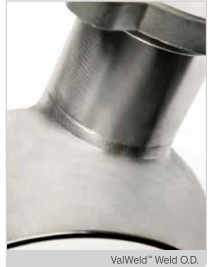
ValWeld™ Weld O.D.