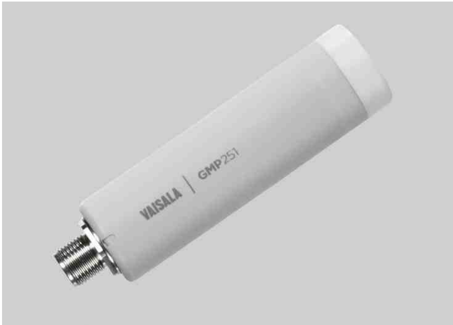
The intelligent, stand-alone carbon dioxide probe GMP251.

The Vaisala CARBOCAP® Carbon Dioxide Probe GMP251 is a new intelligent probe for measuring carbon dioxide. This robust, stand-alone measurement device is designed for use in demanding applications, like life science incubators, where stable, reliable, and accurate performance is required. The GMP251 is based on Vaisala's unique, second-generation CARBOCAP® technology that enables exceptional stability. A new type of infrared (IR) light source is used instead of the traditional incandescent light bulb, which extends the lifetime of the GMP251. The GMP251 incorporates an internal temperature sensor for compensation of the CO 2 measurement according